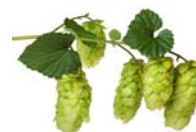
2017 Crop of the Year