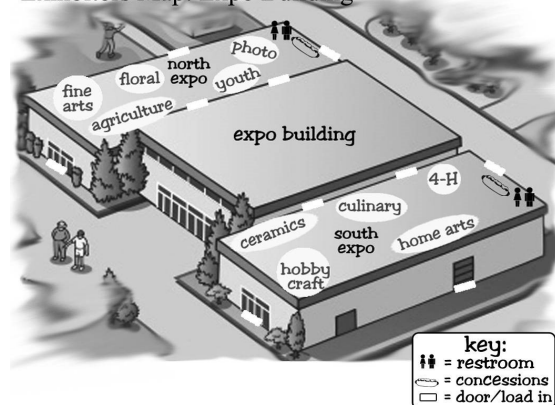
Exhibitors Map: Expo Building