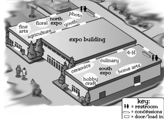
Exhibitors Map: Expo Building